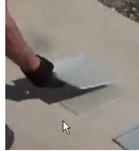
Placing Second Pad