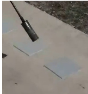
Heating Adhesive Pad