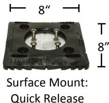
Surface Mount: Quick Release