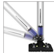
Reactive Spring Unit