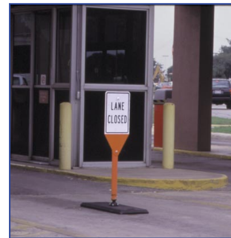
Temporary Lane Closure