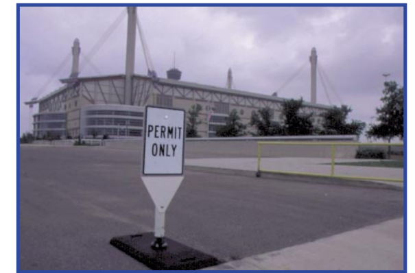
Special Event Signage