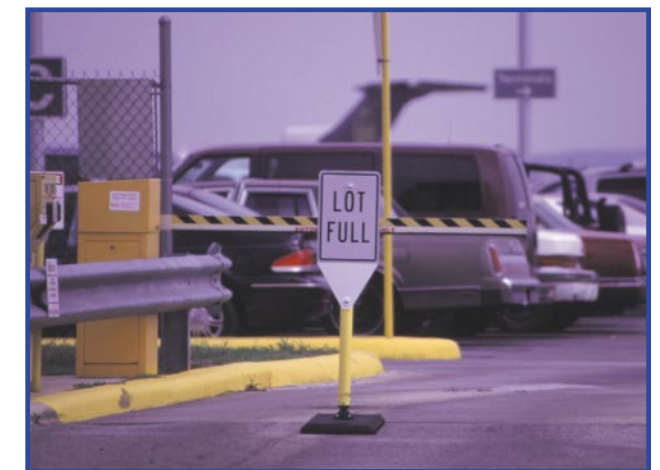
Temporary Lot Full Sign